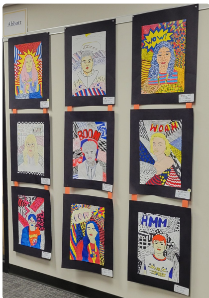
Pop Art Created by Abbott Students

Twenty five Abbott Warriors are showcased in this years Middle School Art Show. The student art will be on display through April 1, 2023, at Elgin State Bank, 50 Tyler Creek Plaza, Elgin, IL., during regular bank hours. Be sure to go see some of the wonderful things our students are creating!