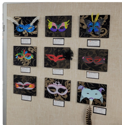
Created by Abbott Students