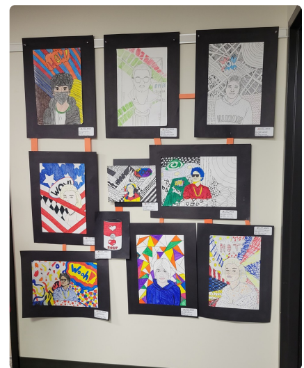
Incredible Pop Art Likenesses